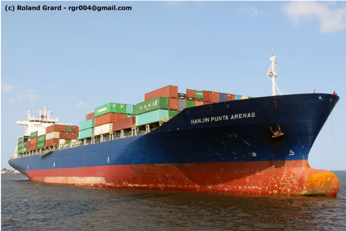
The 1995-built HANJIN PUTNA ARENAS swings to berth at Abidjan. The vessel trades between Algeciras and WAF.