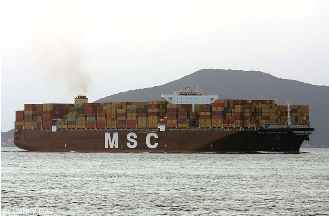
The 14,000 teu MSC EMANUELA arrives at Hong Kong. The vessel trades between the Far East and Europe in MSC's Lion Express.