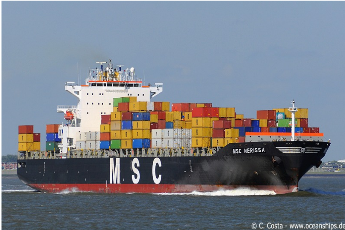
The Hanjin-built MSC panamax MSC NERISSA dashes along the river Scheldt. The ship links Northern Europe to the USEC.