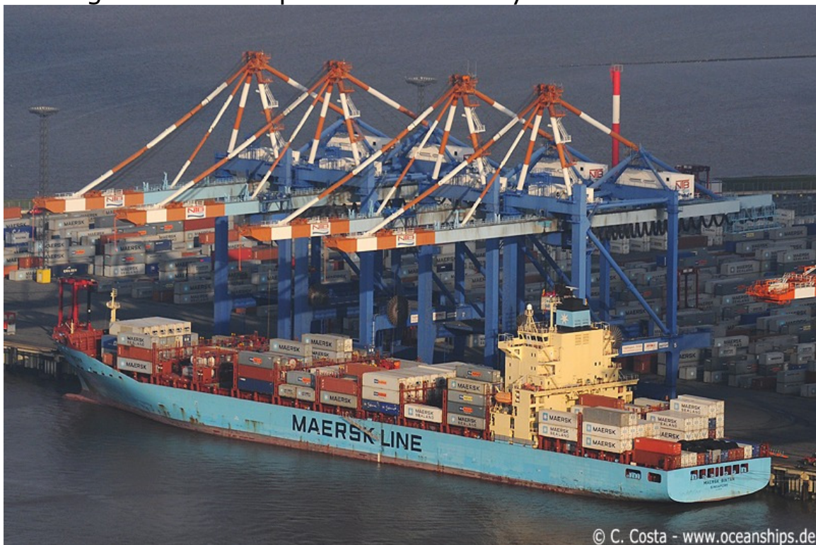
The 3,200 teu ship MAERSK BINTAN is seen here at Bremerhaven's NTB terminal. The ship trades Europe-ECSA.