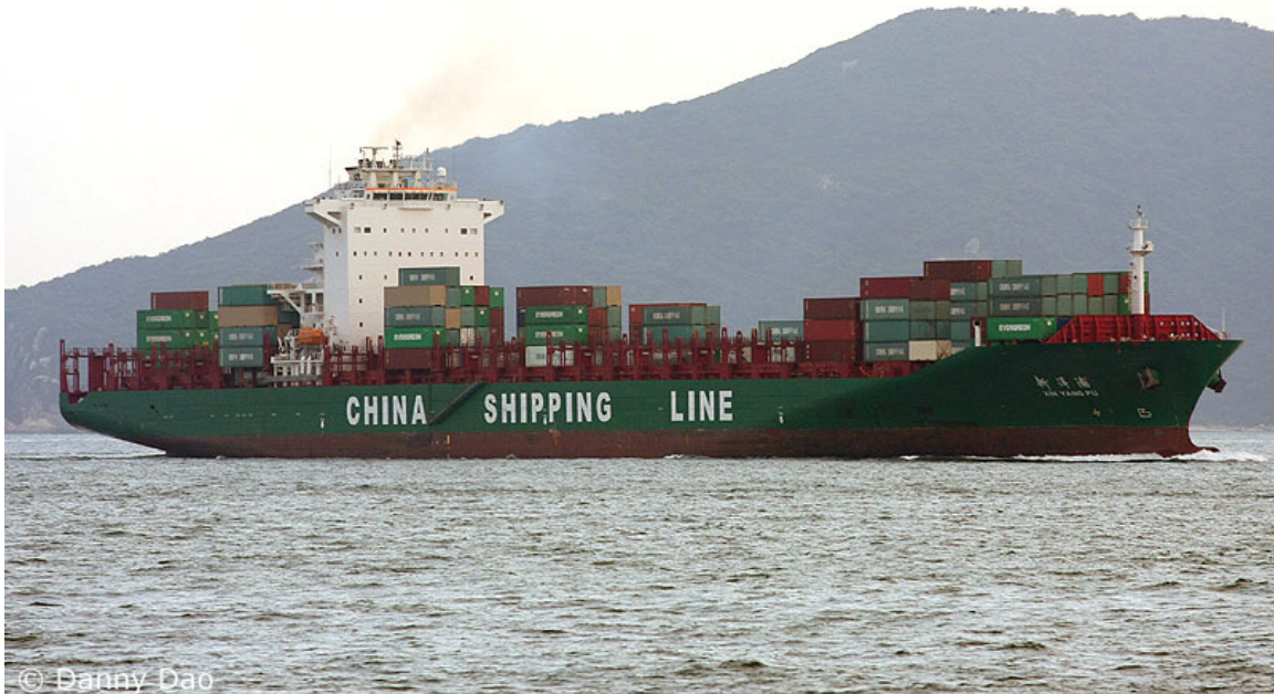
CSCL's near-panamax XIN YANG PU comes into Hong Kong. The vessel is employed in intra-Asian services.